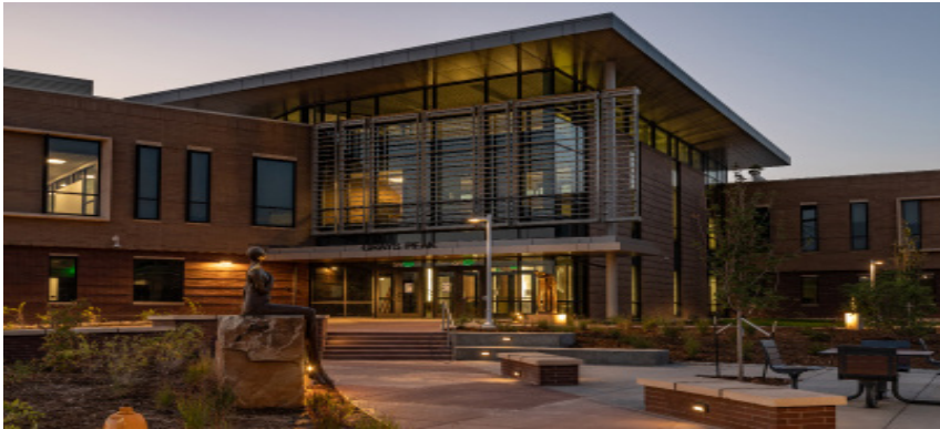
Front Range Community College Larimer Campus-Gray's Peak

We moved onto the FRCC campus in August, after completion of the new Gray’s Peak Health Careers facility.