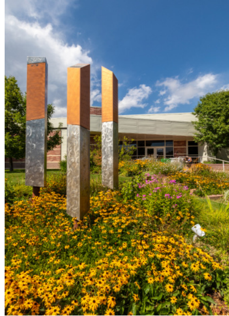
Front Range Community College Larimer Campus-Blanca Peak